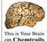
This is Your Brain on Chemtrails