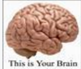
This is Your Brain