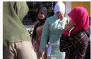
A sharia police officer (left) advises Acehese women wearing tight clothes in Banda Aceh on February 7th. A controversial clause in Aceh's new Islamic criminal procedure code could enslave violators who are not Muslim.